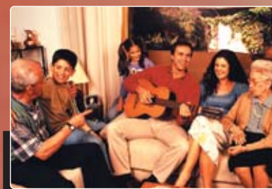
■ Family fun at home.