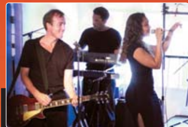
■ Great for bands and live performance