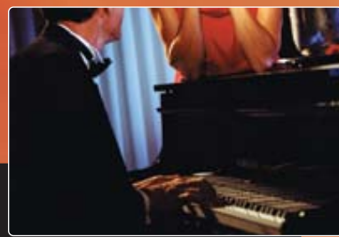
■ Piano bar

Perfect for any application Lounge music, parties, live performance: the Discover 5M is just what you need. The display is touch sensitive, most buttons light up – you simply can't go wrong!