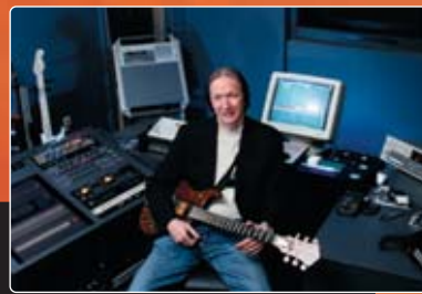
■ Studio applications