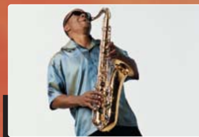
■ Accompaniment of acoustic instruments

Perfect for any application Lounge music, parties, live performance: the Discover 5M is just what you need. The display is touch sensitive, most buttons light up – you simply can't go wrong!